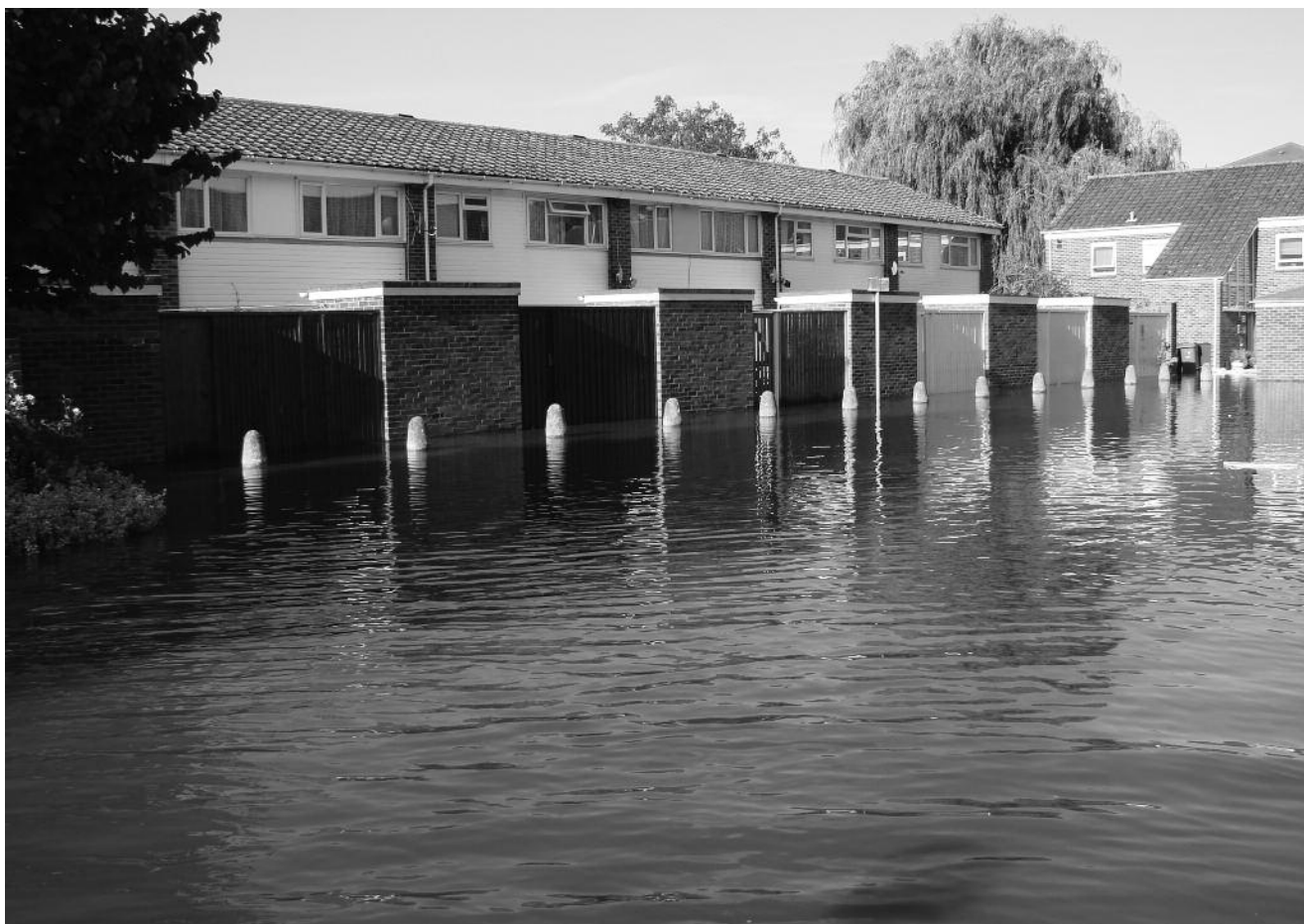
Flooded Houses in the United Kingdom

and evaluation of climate change policy options within the European Commission. Will look to identify the associated costs and effectiveness of an unchecked 5°C mitigation scenario and to develop and appraise a portfolio of longer-term strategic policy options.