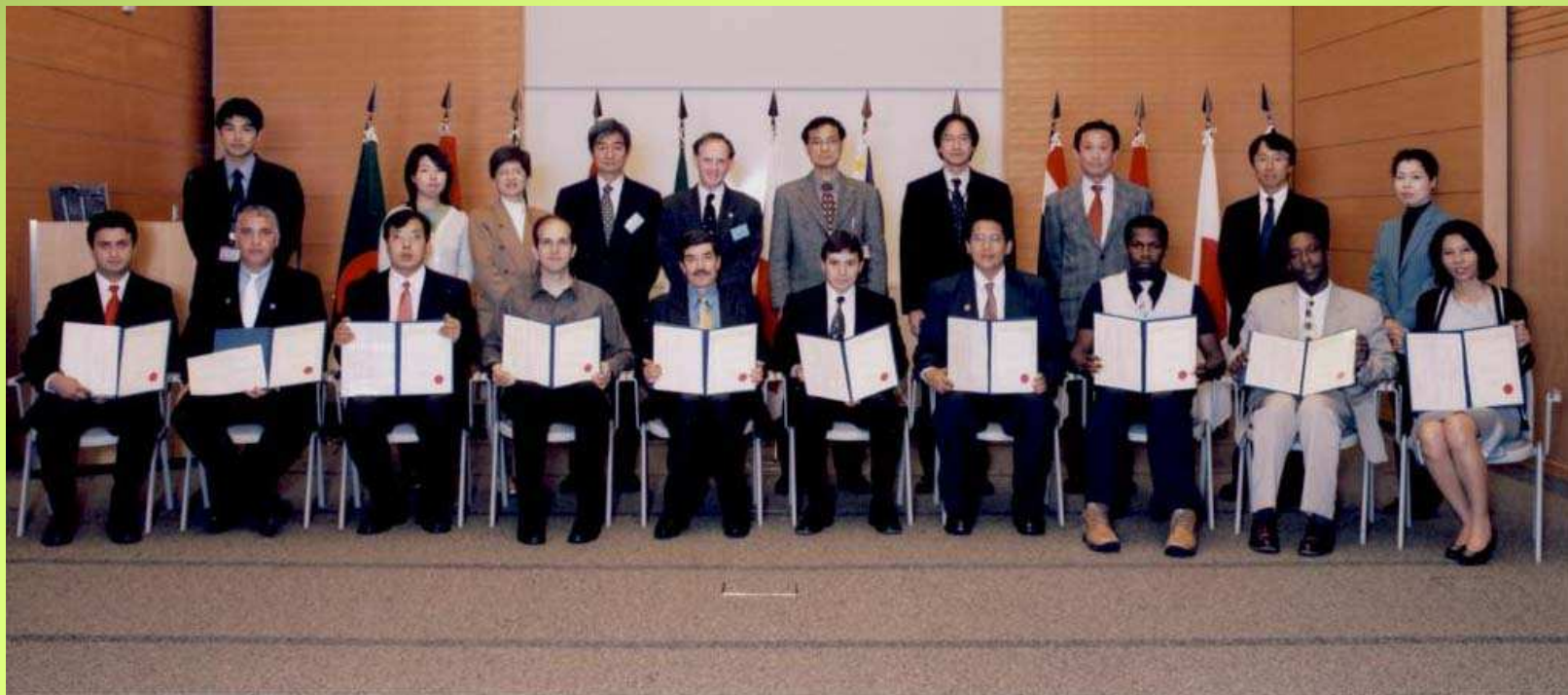
Mitigation Strategy for Mega-Urban Earthquake Disaster F.Y. 2004 November 26th Japan International Cooperation Agency Hyogo International Center