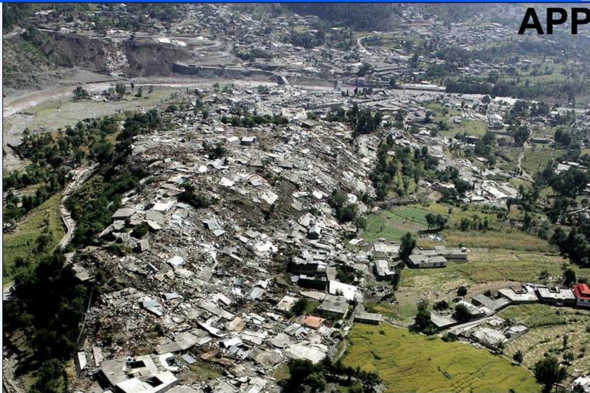
BALAKOT: Oct09 - An aerial view shows the earthquake worst hit town of Balakot a day after a 7.6 magnitude earthquake hit the region. More than 18,000 people were killed so far in the disaster.