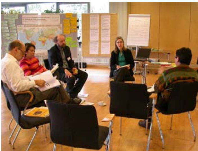
Participants discussing their experiences with DRM instruments.

In January 2007 a group of ICLEI Members and international disaster risk management experts gathered in Freiburg, Germany, for a workshop to assess the usability of 21 selected disaster risk management (DRM) instruments.