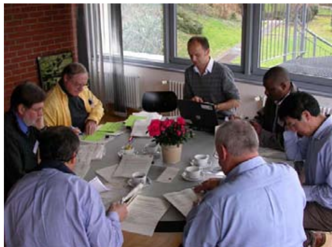
Group work: Assessing the usability of DRM instruments.