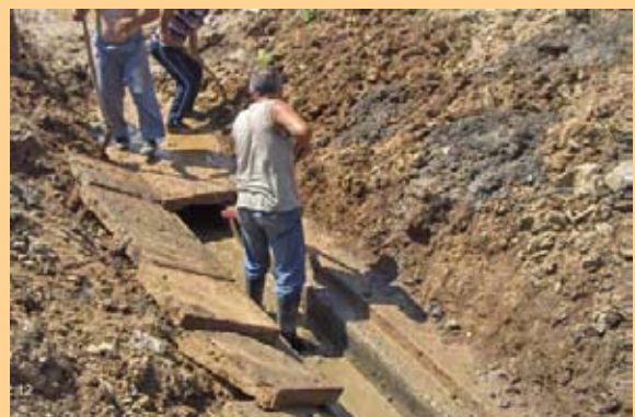
Cleaning the swamp on the Fifth Route in Kicevo, August 2009

In Kicevo, a swamp on the Fifth Route, near the neighborhoods Deveana, Pod