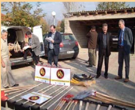
Hand-over of basic fire fighting equipment for the Strumica micro-region, 29th October 2009

There is an ongoing implementation of small-scale risk reduction projects in three selected micro-regions, Veles, Strumica and Kicevo. As part of the overall efforts to improve the preparedness at local level, on 29