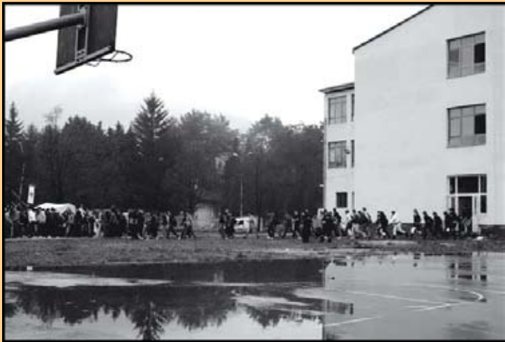
Training drill in Kicevo, 9th November 2009

A total of 1597 high school students (450 from the high school Dimitar Vlahov in Strumica, 250 from the high school Koco Racin in Veles and 897 from the high school Mirko Mileski in Kicevo), 144 teachers and other staff (60 from Stru-