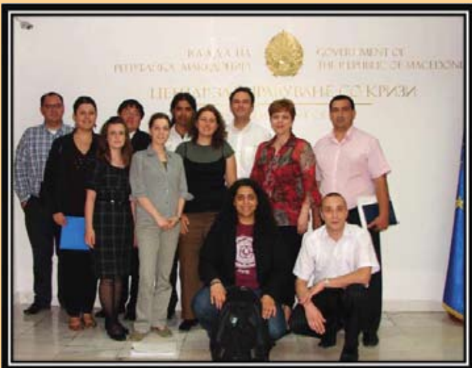
Participants of the workshops, May 2009

As a support to the CMC's Gender Thematic Group, Web Based Gender Repository Database and Web Based System for Learning, Exams and Survey (E-Learning) software were developed. The Gender Repository Database software presents an application where qualitative and quantitative data related to gender activities will be accumulated in order to ensure better approach of CMC for cohesive gender based analysis, monitoring and evaluation process. The working version of the application is uploaded on CMC's Intranet System. The Web Based System for Learning, Exam and Survey software will raise the awareness of the CMC's employees about gender issues into crisis management area and will contribute for development of human approach where gender issues will be easily addressed, properly considered and effectively resolved. As a basis for strengthening the employee's knowledge, a Guide for Gender Mainstreaming into Crisis Management and set of approximately 60 questions have been developed.