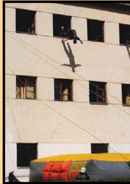
Training drill in Strumica, 9th October 2009

A total of 1597 high school students (450 from the high school Dimitar Vlahov in Strumica, 250 from the high school Koco Racin in Veles and 897 from the high school Mirko Mileski in Kicevo), 144 teachers and other staff (60 from Stru-