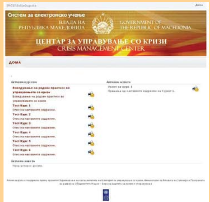
E-Learning software application

A gender expert, engaged by the CMC and UNDP, held two workshops in May 2009 focusing on gender equality and gender mainstreaming into crisis management. Representatives from the Directorate for Protection and Rescue, Macedonian Red Cross, CMC and UNDP participated in these workshops. It is expected that the trained participants will contribute to the development of the future project activities, including the development of a draft version of a Gender Responsive National Crisis Management Plan.