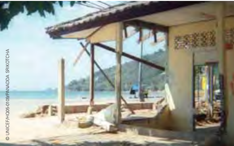
A building that was partially destroyed by the tsunami faces a calm sea and a white sand beach in the Kato District in the province of Phuket, Thailand. Photographed by Panadda Srikotcha, who described the scene as 'the sea that frightened me'.