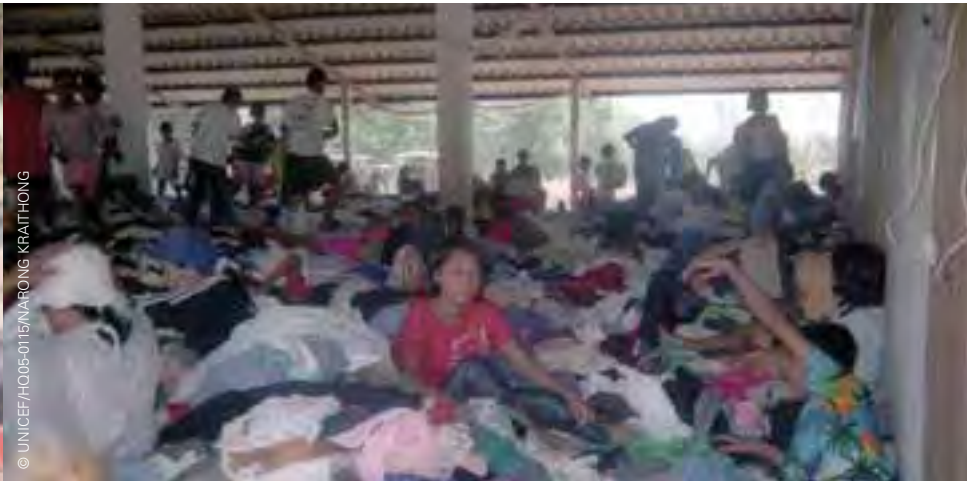
Children in the Takua-Pa District in the province of Phang na, Thailand, sit amidst piles of donated clothing at a temporary shelter for people whose homes were damaged or destroyed.

usually the trend is for the fervour to die out as soon as the media hype is cooled up.”