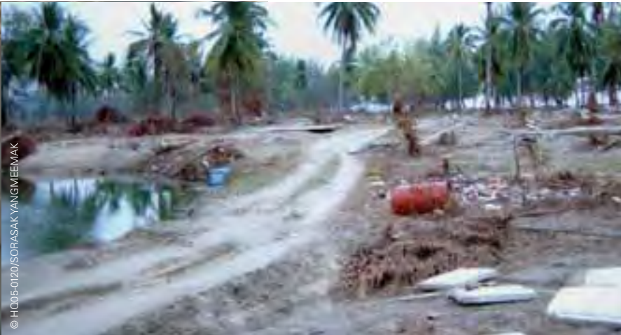
A road runs through a coastal area littered with debris in the Takua-Pa District in the province of Phang na, Thailand.