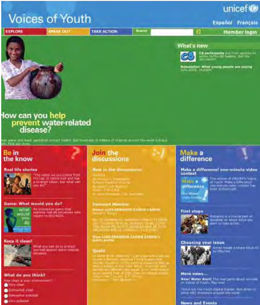
Voices of Youth website: www.unicef.org/voyn

There were equally poignant messages from young people in countries far removed from the calamity, offering words of sympathy, compassion and unity.