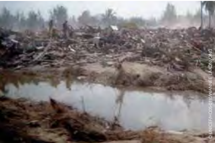
People search through debris in a coastal area in the Takua-Pa District in the province of Phang na, Thailand.