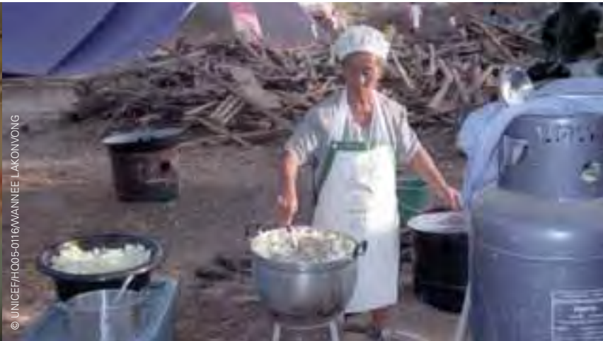
A woman cooks in an outdoor area of a temporary shelter in the Takua-Pa District in the province of Phang na, Thailand. Photographed by Wannee Lakonvong, a 15-year-old girl in Grade 8, whose home was damaged.