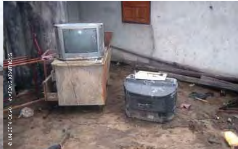
A damaged home in the Takua-Pa District in the province of Phang na, Thailand.

Some of the young people who had witnessed long years of ethnic strife spoke of their determination to leave the past behind and work towards peace , an example of the unique strength of the young: the ability to strive for creative solutions without dwelling too long on the past.