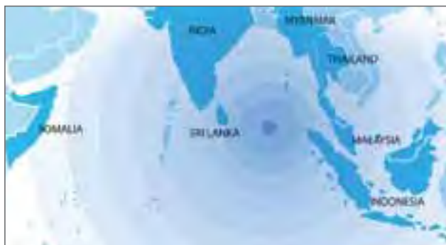
This map does not reflect a position by UNICEF on the legal status of any country or territory or the delimitation of any frontiers.

Over the months that followed, young people all over the affected region took action, helping to distribute aid, assisting with clean-up and rebuilding efforts, looking after those younger than them, and using their creativity to let others know about the devastation.