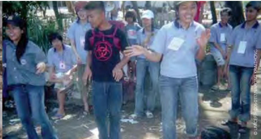
Adolescents entertain younger children in the Takua-Pa District in the province of Phang na, Thailand.