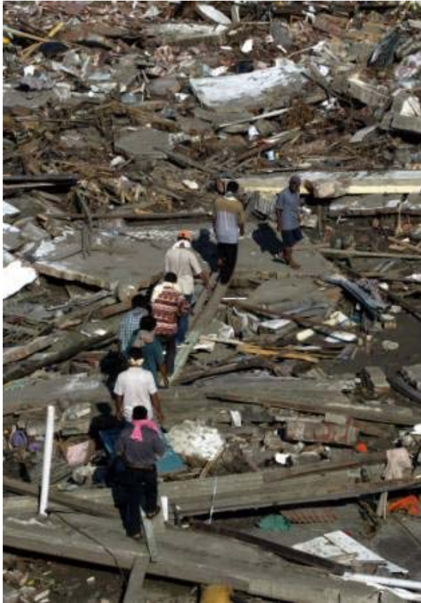
Wide-spread destruction as a result of the Indian Ocean Tsunami in December 2004

sustainably, but also reduces the risks that natural and man-made hazards pose to people living today. Emphasizing and reinforcing the centrality of environmental concerns in disaster management has become a critical priority, requiring the sound management of natural resources as a tool to prevent