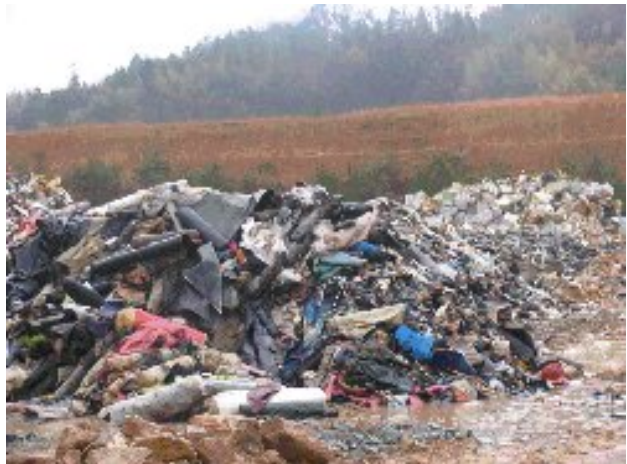
Effective management of debris and rubble is a critical environmental need in the follow-up to a disaster

The impacts of disasters, whether natural or man-made, not only have human dimensions, but environmental ones as well. Environmental conditions may exacerbate the impact of a disaster, and vice versa , disasters have an impact on the environment.