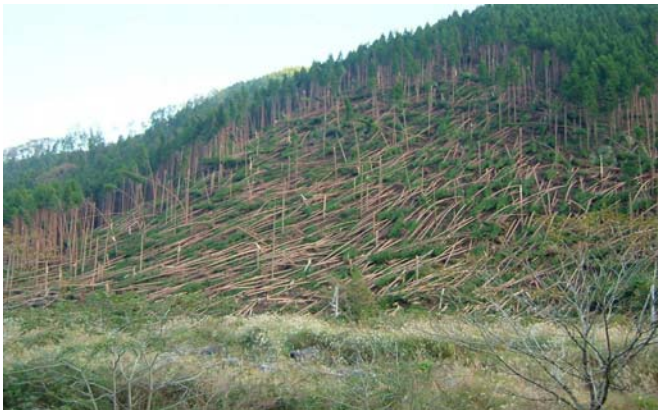
Effects of disasters on natural resources

The November 2004 typhoons in the Philippines claimed over 1,000 lives and devastated the livelihoods of many more. The recent Indian Ocean Tsunami was even more destructive: more than 150,000 lives were lost.