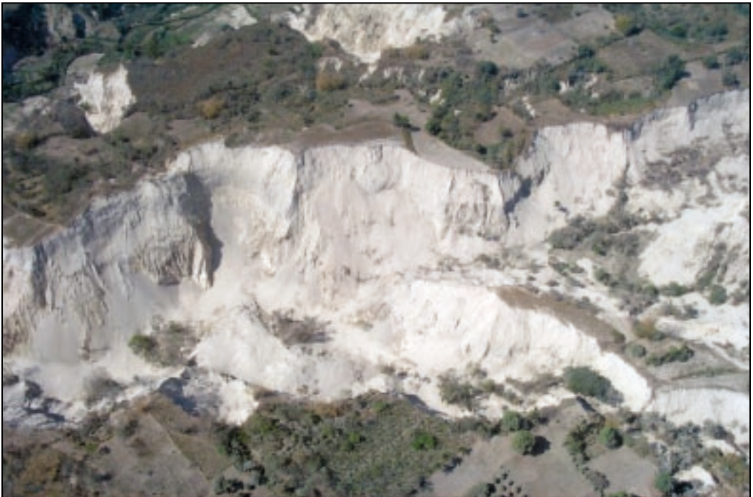
Figure 3. Aerial view of coalescing falls and slides in rhyolitic tephra east of Lago de Ilopango caused by the February 13 earthquake. The abundant fine-grained landslide debris in the valleys may be mobilized as debris flows during the upcoming rainy season.

ing distance away from the epicenter. The shaking generated thousands of shallow landslides in the deeply dissected terrain surrounding and east of Lago de Ilopango, it triggered large landslides in the Río El Desagüe and the Río Jiboa drainages, and it caused several major landslides on the north side of Volcán San Vicente. It also generated local liquefaction and lateral-