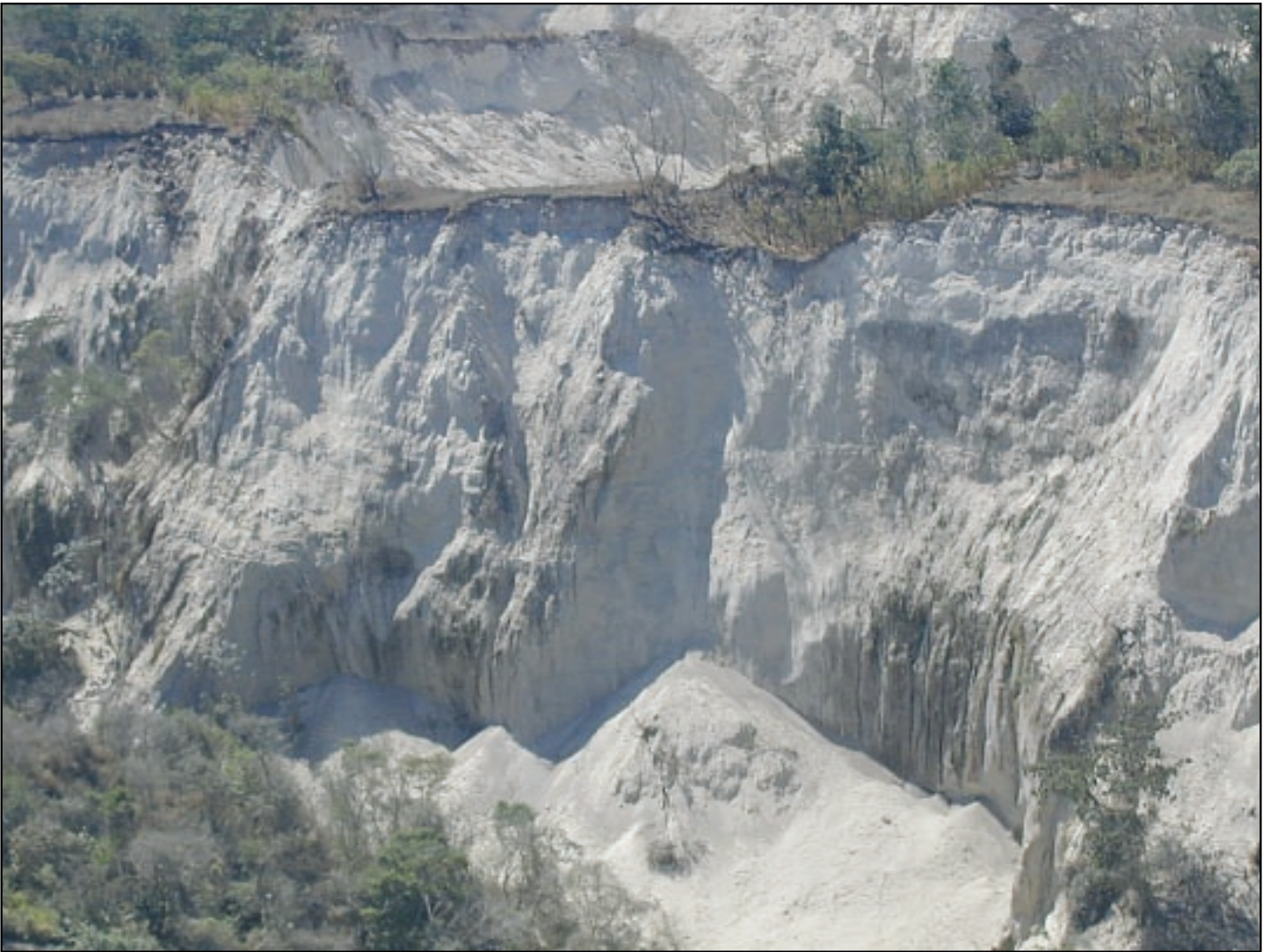
Figure 12. Widespread landslides in the Quebrada El Camalote, a tributary to the Quebrada El Chaguite drainage basin, exposed thick deposits of Tierra Blanca tephra. The loose tephra has now clogged the narrow valleys, and during the coming rainy season, much of the easily eroded tephra will be transported down the drainage system and into Lago de Ilopango.

S an Agustín is exposed to risk from several natural hazards. Liquefaction and lateral spreading caused damage during the February 13 earthquake, but these hazards will not cause further damage unless another strong earthquake occurs. To minimize the potential damage from future lateral spreading, one option is to relocate those homes damaged by lateral spreading to sites farther away from the lake shore or on higher ground, where the potential for lateral spreading is less. A possible relocation site is on the northwestern side of the village, in the area that is currently occupied by families living in emergency shelters. The vacated part of the village where lateral spreading occurred (and may occur in the future) could be used for recreational purposes such as soccer fields, where no structures would be located.