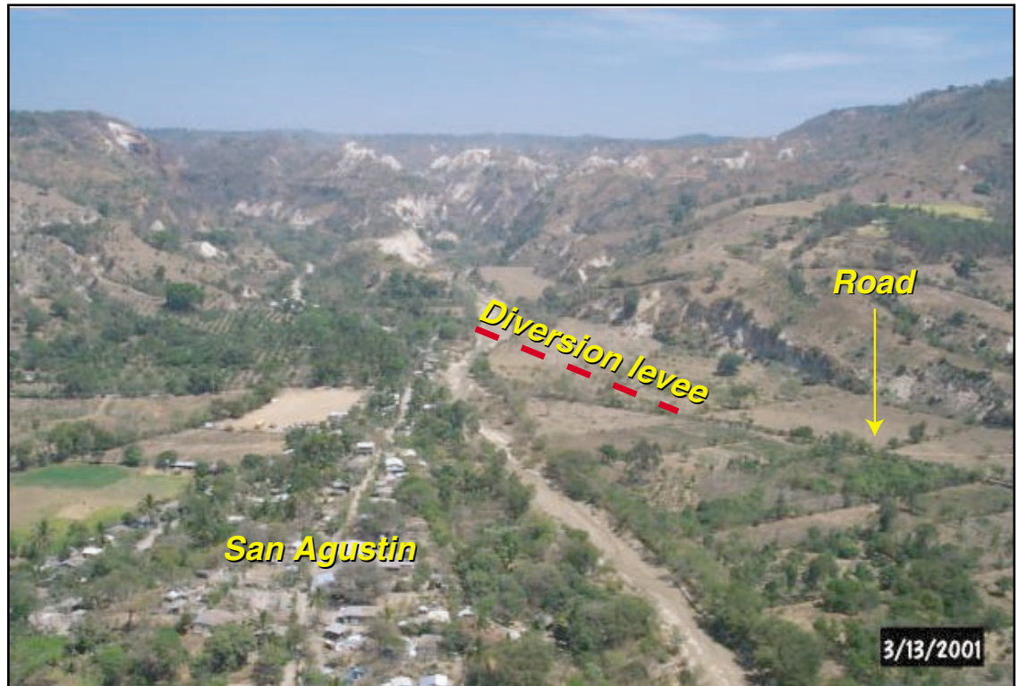
Figure 13. View toward the north of San Agustín and the adjacent stream course where large sediment influxes in the rainy season may cause the stream to change course and flow toward the village. A proposed diversion levee would direct the flow to the east into an ancient stream channel. This diversion would likely damage a road to a nearby finca (coffee plantation), but would reduce the potential of flooding in the village.

Flooding during the coming rainy season poses a more imminent threat to San Agustín and could originate in two ways. First, small lakes could form in the sediment-clogged valleys of the Quebrada El Chaguite and tributary drainage basins, and breaching of these lakes could send the impounded water rushing down the valley. Because the valleys in the upper reaches of the drainage basins are so narrow, the volume of water likely to be released in these breaching events would probably be relatively small and probably would not cause substantial flooding. The more significant flood hazard is associated with excessive sedimentation in the current stream channel and diversion of the stream flow into a new chan-