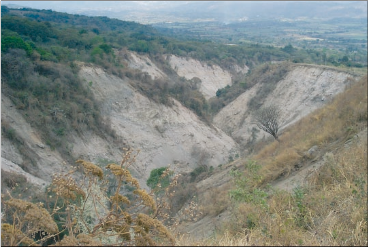
Figure 7. View to the northwest down the upper reaches of Quebrada El Blanco channel showing coalescing debris slides from the valley walls. The channel bottom is clogged with landslide debris, and rainfall runoff may trigger debris flows in these sandy, silty deposits.

over the years, the original site has been resettled.