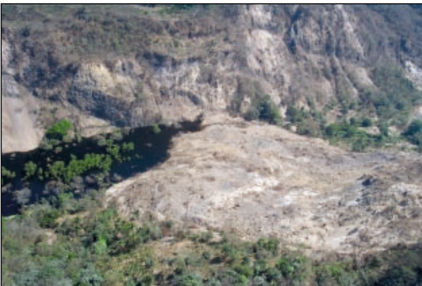
Figure 4. View to the north of the rotational slump/rock avalanche deposit that has dammed the Río El Desagüe near its confluence with the Río Jiboa. A shallow lake upstream from the landslide (left side of photograph) is draining through a man-made spillway that has been excavated across the toe of the landslide.

The Río El Desagüe lake is about 1.5 km long and contains an estimated 500,000 m 3 of water. The lake's maximum depth is estimated to be about 5 m on the basis of exposed tree tops near the landslide dam (fig. 4). A hand-dug spillway channel has been excavated across the toe of the landslide to allow the lake to drain. The flow in this 3-m-wide, 2-m-deep channel was about 0.2 m 3 /sec in mid-March 2001 and was not eroding landslide debris in the spillway. Large, indurated clasts in the landslide debris have effectively armored the spillway and are preventing erosion of the dam under present low-flow conditions. Because the lake is actively draining across the spillway, its depth and volume will remain relatively constant. Even as flow in the Río El Desagüe increases during the rainy season, the large blocks of lithified rock will minimize erosion of the spillway, and will likely prevent a catastrophic failure of the landslide dam.