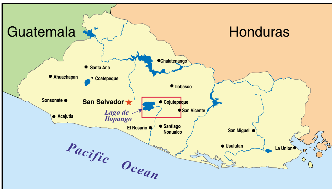
Figure 1. Map of El Salvador showing the approximate area (red rectangle) of abundant landslides associated with the February 13, 2001, M_w 6.5 earthquake. Most of the landslides were in areas underlain by thick deposits of young rhyolitic tephra erupted from Ilopango caldera, which is now filled by Lago de Ilopango. See figure 2 for detailed map of the area.

February 13 earthquake were more localized than the January event, but they were equally devastating. Three hundred fifteen fatalities and 3,399 injuries are attributed to the February event. The localized impacts of the February earthquake were related to its relatively shallow depth, only about 14 km deep. This resulted strong shaking in the immediate area of the earthquake, but the intensity of the shaking diminished rapidly with increas-