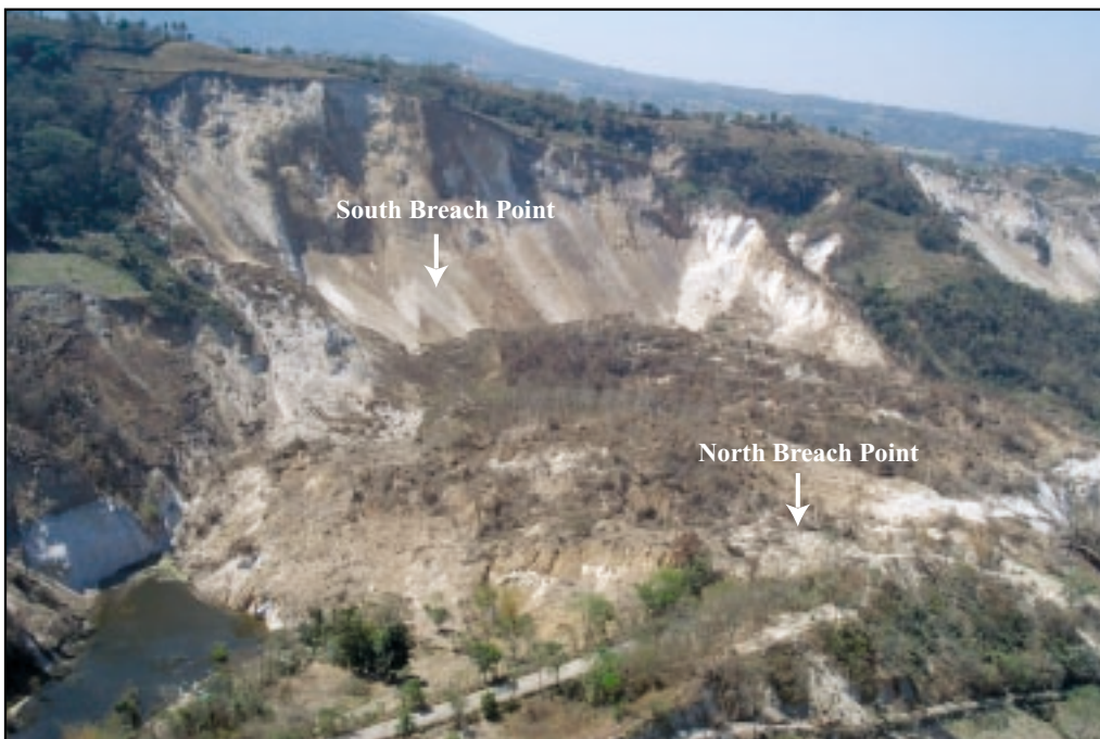
Figure 5. View to the southwest showing the landslide dam on the Río Jiboa. The impounded lake behind the landslide is visible on the lower left. Two possible points are labeled where the reservoir may overtop the landslide dam, if allowed to breach naturally.

If allowed to fill completely, the lake will have an estimated maximum depth of 60 m, a length of about 2 km, and a volume of about 7 million m 3 . Two possible breach points exist on the landslide dam (fig. 5); the northern breach point has an estimated elevation of about