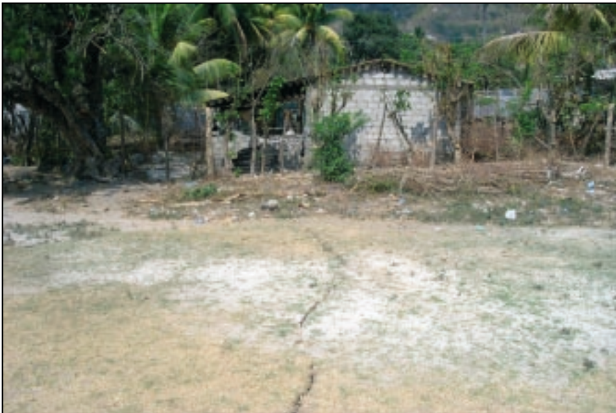
Figure 10. Liquefied sand that flowed to the surface through cracks and fissures during the February 13 earthquake in San Agustín. These sand boils formed on the village's soccer field.