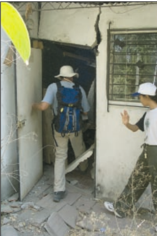
Figure 11. Damage to a home in San Agustín from lateral spreading beneath the structure. Further movement probably not occur again unless the sediment is severely shaken by another strong earthquake.