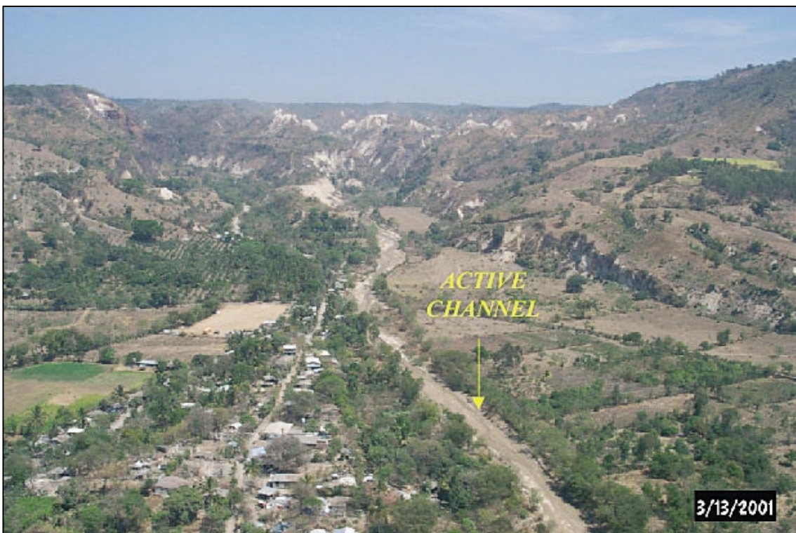
Figure 8. View to the north of the Quebrada El Chaguite drainage basin and the village of San Agustín (in left foreground). The February 13 earthquake caused extensive damage in the village and widespread landslides throughout the drainage basin. The village of San Agustín is located adjacent to the active channel of the young alluvial fan of the quebrada.

Agustín is built on deposits that have these characteristics. During the strong, sustained shaking associated with damaging earthquakes, water in the pores between the sediment grains is pressurized as the seismic waves travel through the deposits. The pressurized water reduces the strength of the sediment by pushing the sediment grains apart. As a result, the sediment can temporarily behave more like a fluid than a solid. In this fluid-like state, the sediment can flow laterally down very gentle slopes (gradients of only a few degrees) to form lateral-spreading landslides. At the upper end of lateral-spreading landslides, scarps