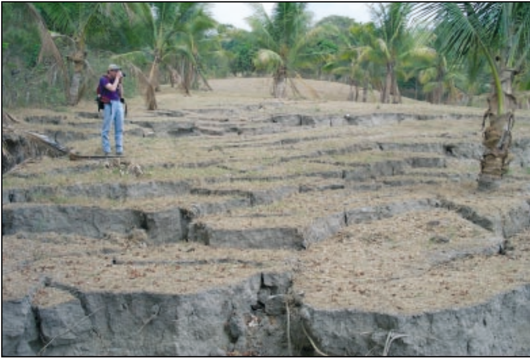
Figure 9. Ground deformation and scarps that formed at the head of a lateral-spreading landslide adjacent to the “Zona Experimental de Cultivo de Peces” on the eastern shore of Lago de Ilopango. Buildings that span scarps similar to these commonly suffer considerable damage.

can form (fig. 9), and structures that span these scarps are likely to be damaged. In addition, the pressurized water mixed with sand commonly erupts onto the ground surface along fissures and cracks and leaves distinctive deposits of sand called sand boils (fig. 10).