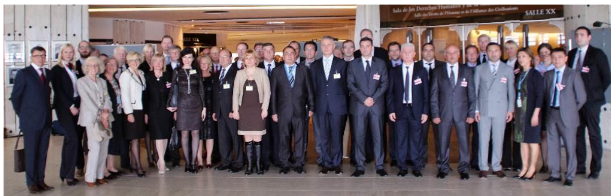
Participants of the Ministerial Meeting on Housing and Land Management on 8 October 2013 in Geneva

The second part of the Strategy outlines the types of activities that the Committee will use to achieve its objectives and targets. These activities were highlighted as priorities in the results of the survey on challenges and priorities in housing and land management for the ECE region.