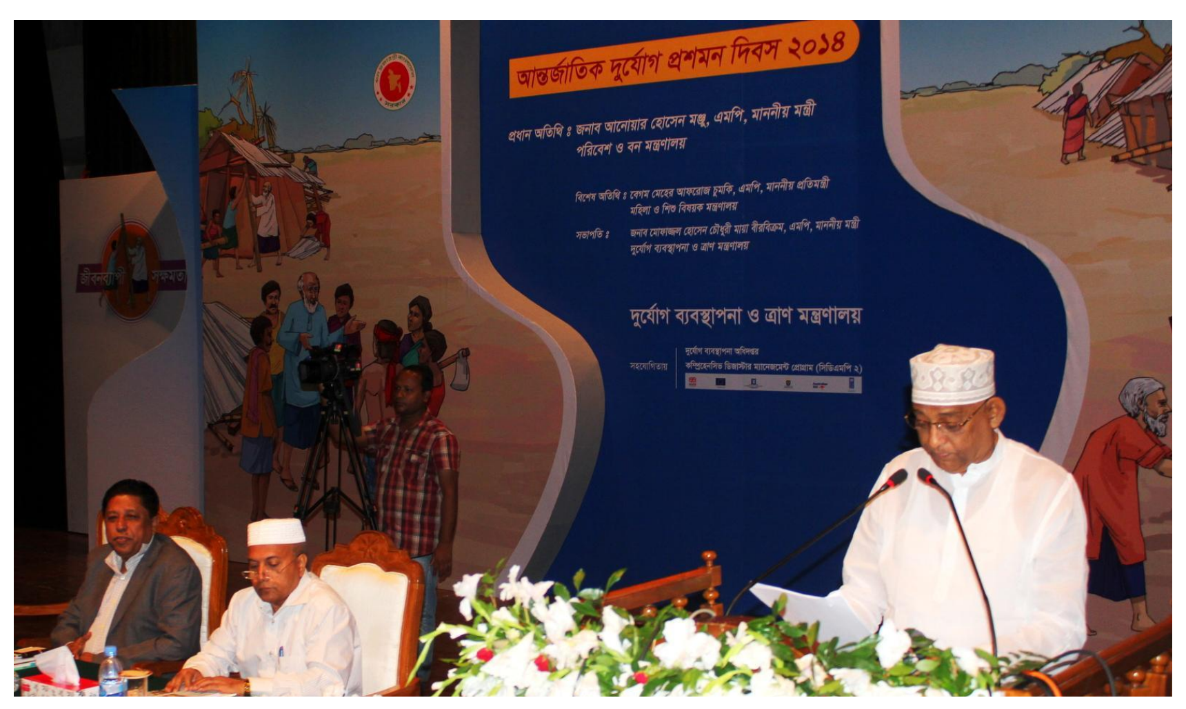
Disaster Management and Relief Minister Mr. Mofozzal Hossain Chowdhury Maya, Bir Bikram, MP