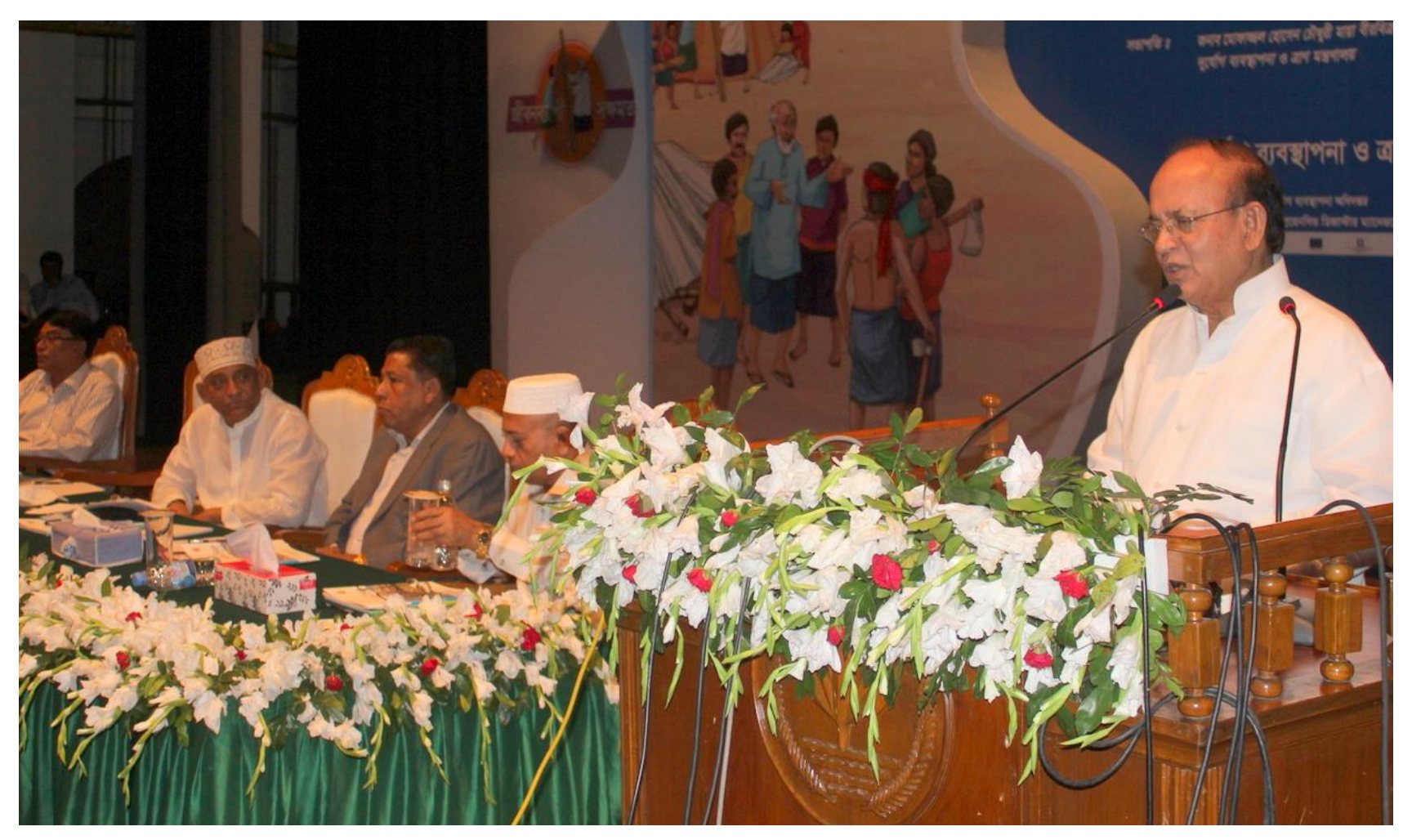
Mr. Anwar Hossain Manju, the Minister for Forest and Environmental Affairs