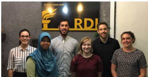
Intern Welcome Party (23/09)