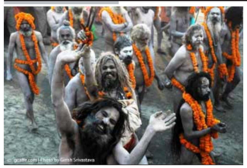
Dates of Maha Kumbh Mela at Nashik, Maharashtra, India.

heavy rains accompanied by lightning and squall flattened and uprooted the makeshifts tents of pilgrims.<sup>1</sup>