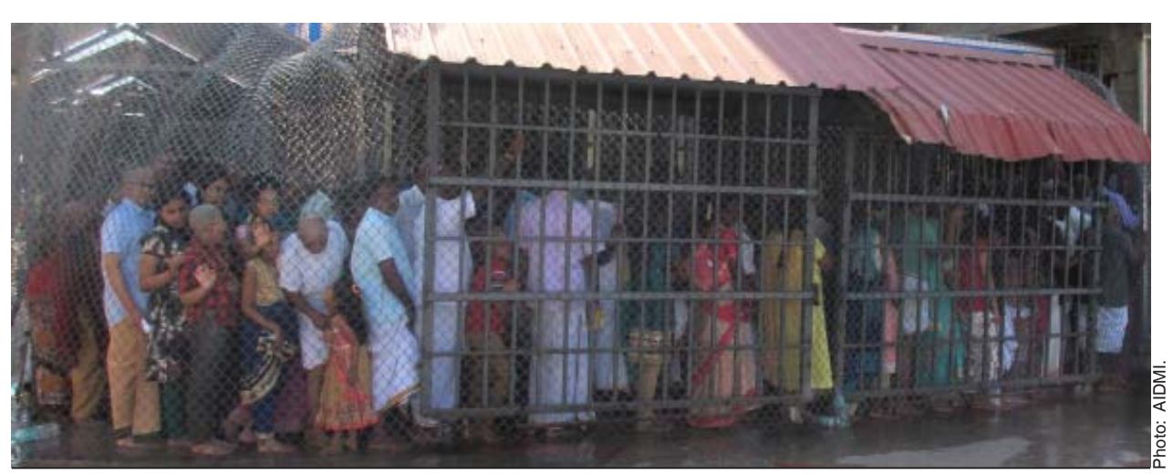
Devotees thronging the Tirupati Balaji temple, Tirumala, Andhra Pradesh.

Different regions, religions and faiths have their own ways of celebrating their festivals. Generally, these celebrations end up becoming an event of mass gathering. With such events, it becomes imperative for the local administration/government to get involved and make arrangements to keep the conduct of the events as smooth as