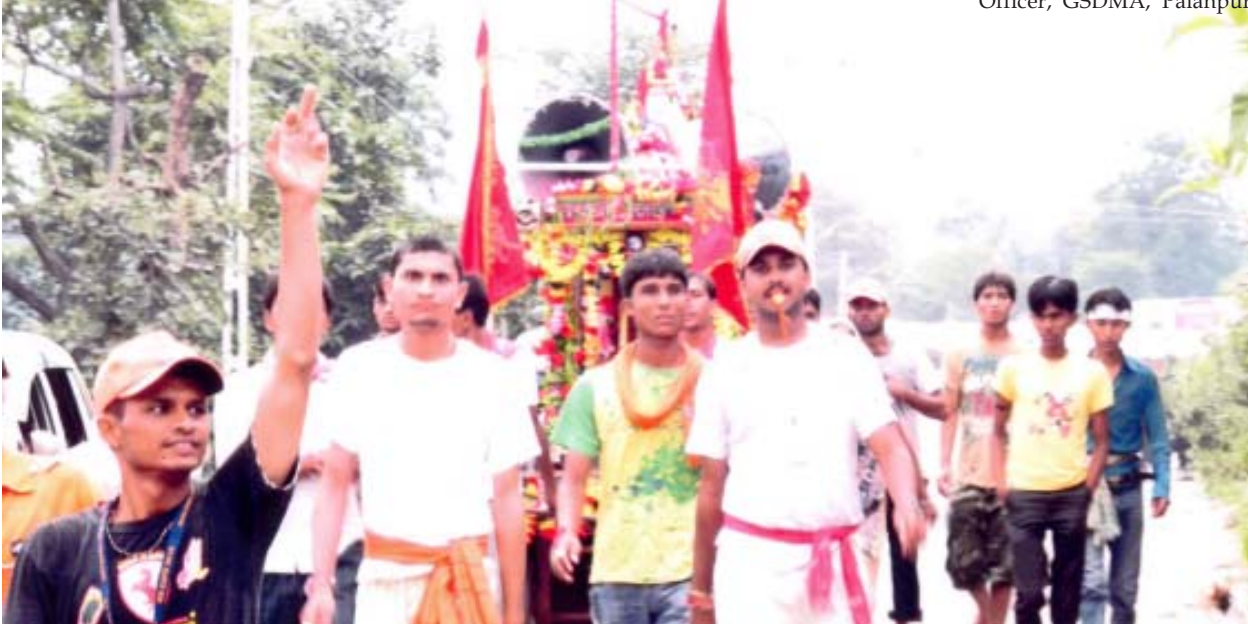
A procession being taken out by devotees at Bhadrapadi fair, Ambaji, Arravali, Gujarat.