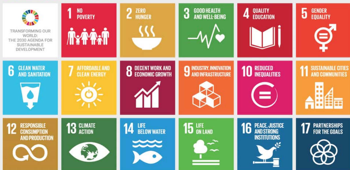
The 17 officially noted Sustainable Development Goals.