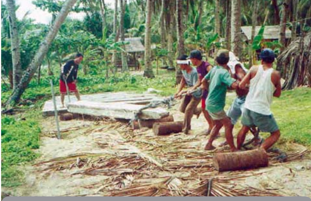
Concrete slabs for a seawall are moulded and hauled manually by the volunteer working groups.