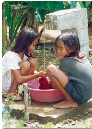
Many of the mitigation measures are health-related. They are improving the daily lives in the community, and not only during hazard situations.