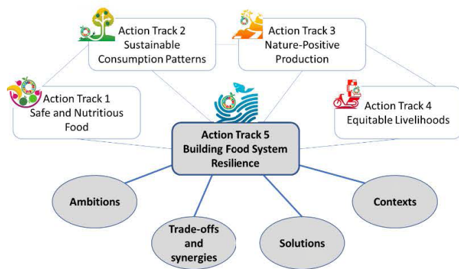
Figure 1. Representation of the integrative perspective of Action Track 5 across other action tracks and key elements addressed by Action Track 5 to build food system resilience.

The concept of resilience first emerged in the context of ecological stability theory (Holling 1973). It was directed at understanding the capacity of ecosystems to sustain perturbations