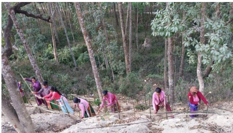
Figure 1: Mother groups practicing bioengineering techniques.

During the course of implementation, the women group was led all the project activities at community level i.e. awareness raising, establishing demonstration sites for eco-safe roads, establishment of community nursery of bioengineering species, selection of grass species for bioengineering research, training on bioengineering technology, generating the evidence, engaging policy makers, sharing the