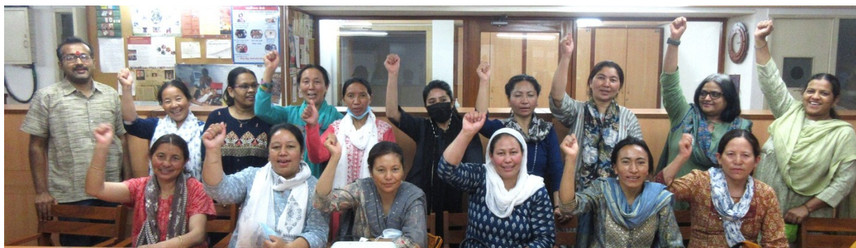
Training on Women Led Disaster Preparedness, Ahmedabad, Gujarat, India.

The above are some of the normative prescriptions that can help in improving women's enhanced vulnerability to disasters and help them further evolve as effective and credible agents of resilience building in South Asia. ■