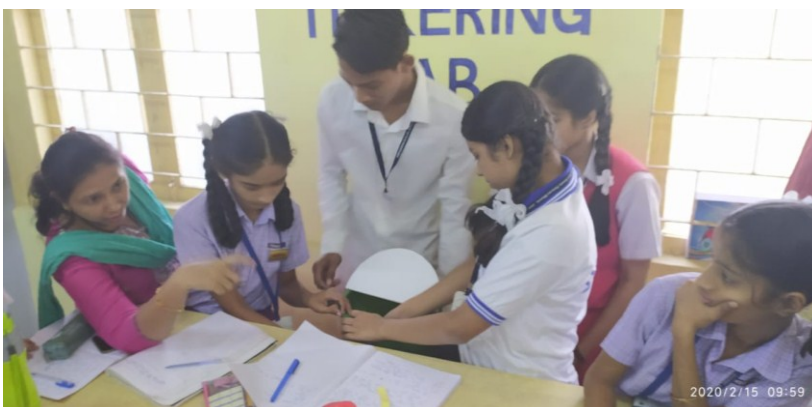
File Photo of an Atal Tinkering Lab in Mumbai led by a Woman In-charge.

Civil Defence Professionals and Home Guards need to be on their toes when it comes to taking actions