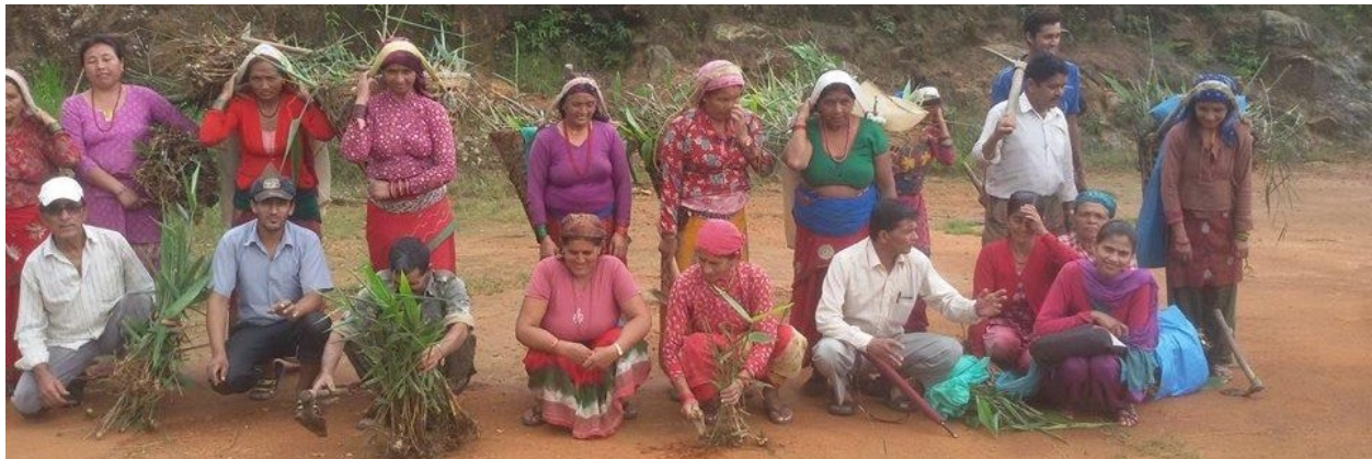
Figure 2: Members of mothers group ready for bioengineering training.

lessons learned and practicing nature conservation practices with the technical support of District Soil Conservation Office (DSCO) and facilitation of IUCN Nepal. They were successful in demonstrating the results of protecting infrastructure (school and community houses) especially from the effects of landslides through the Nature based Solutions approach.