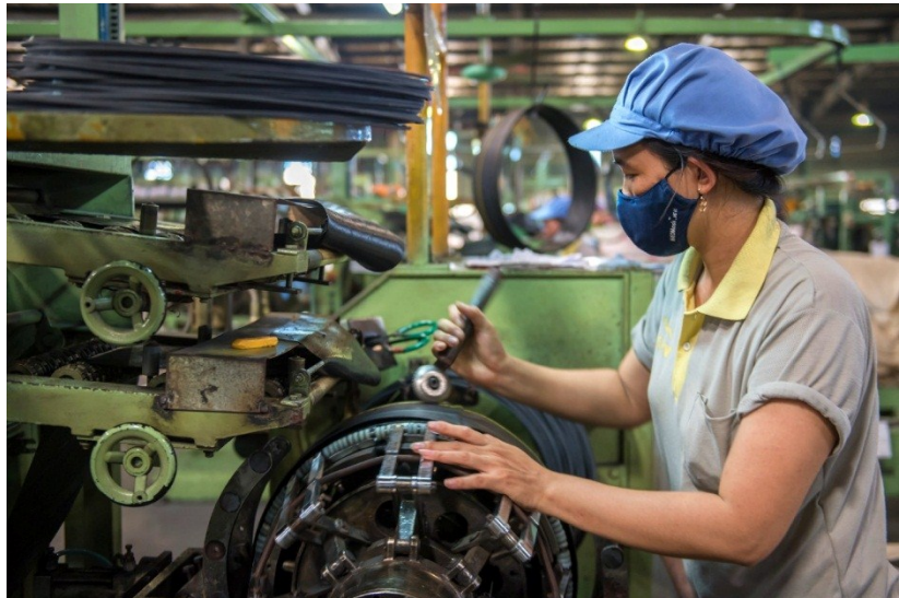
Women in Southeast Asia were more likely to lose their jobs during the pandemic than men.

Beyond job losses however, the differential impact was reflected in far more labor force exits among women, in all our sample countries and across nearly all ages, while men were more likely to become unemployed. This means that in contrast to men, most women who had lost their jobs were not searching for work and/or were not available to take up work.