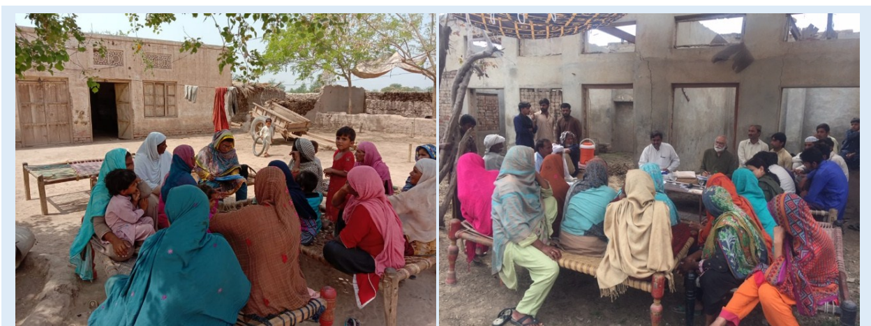
Unleash hidden potential of women.

To assess the acceptance of the gender strategy, we selected the most conservative community for testing. In village Sunnakh, more women than men participated in a brainstorming session on the role of women in reconstruction and rehabilitation. We were pleasantly surprised to see burqa (veil) clad women being articulate and frank while giving analyses and suggestions. The women of Megha village, district Sargodha disagreed with the male community. The village was situated on the left bank of River Jhelum and prone to annual flooding. While male members wanted us to reconstruct houses, the women suggested us to build embankment around the village. They argued embankment would save them from future inundations. It will save our mud houses too. They also argued floodwater would not spare even the pukka house. So, what's the point of building houses. After some discussion many men changed their opinion in favour of women's position. In other villages