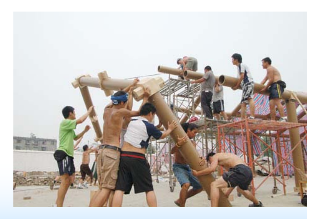
Students set up Shigeru Ban Research centre temporary paper tube housing structures

Bolder steps in reconstruction to transform Wenchuan earthquake-affected areas into a model of green low-carbon economy