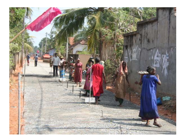
Photo 3: Placing base course using strings, pegs & line levels for layer thickness & camber control

The EU also funded the Environmental Remediation Programme (ERP), implemented by UNOPS in the same District. ERP cooperates closely with CAP, by design, to remediate gravel borrow pits used to source materials, which is likely to be the first such example of environmentally conscientious use of the material on the East coast of Sri Lanka.