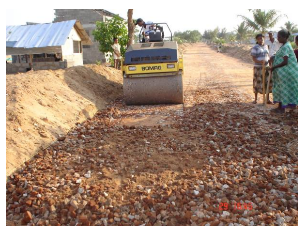
Photo 2: Compacting crushed and blended tsunami debris for sub-base layers.