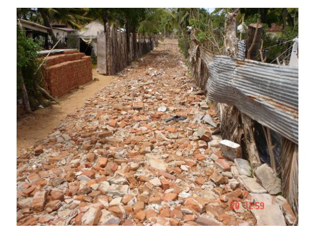
Photo 1: Dumping of unprocessed tsunami debris for road construction – a wasteful process.